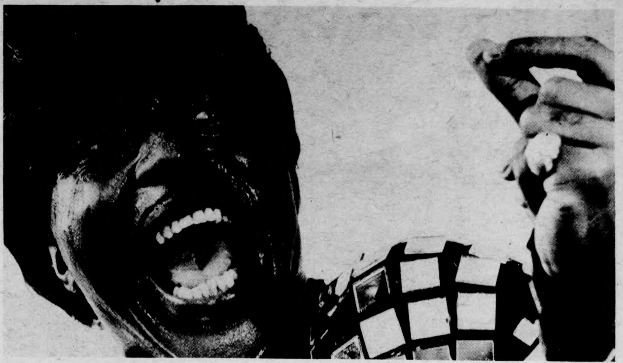
Frantic singer and pianist Little Richard guaranteed to play at Revival

The handbook covers a large number of topics from social science courses to the liberation of women. It has an interesting diary of the progress that has been made by student activists on the campus. An illuminating unique handbook, Brave New School is a bargain at 15 cents.