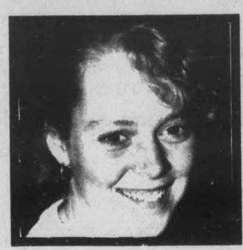
BBA(III) "Having a good time"