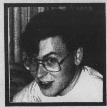
BBA(IV) "He's an artsie conversing with an intellectual equal"