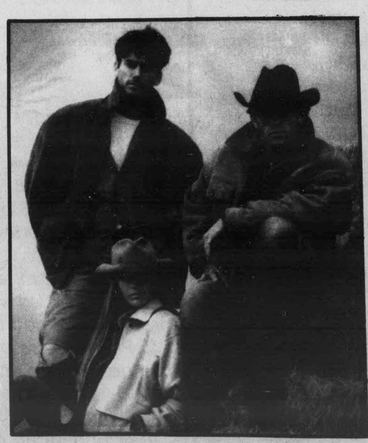
A Classic Combination LEATHER & DENIM