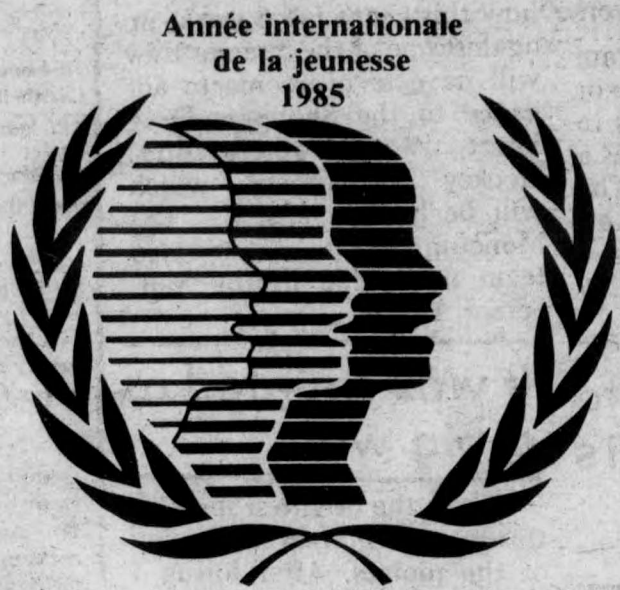
International Youth Year