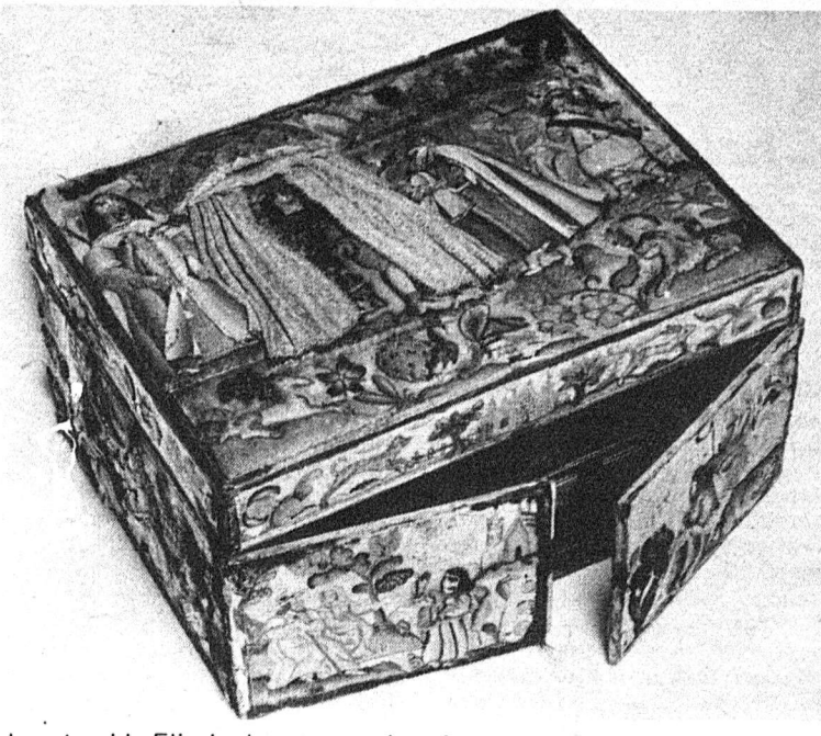
Irreplacable Elizabethan storage box for tapestry

A director would help remedy the stiuation.