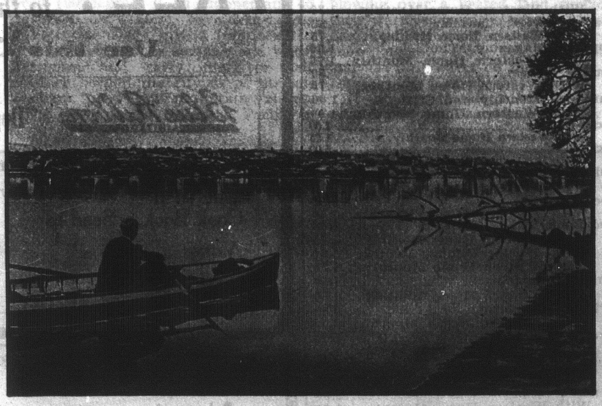
New Westminster, B. C., from the Fraser.

The principal industry there at present is lumber, a number of large saw mills being constantly in opera-tion the whole year around. It is from this point that much of the best lumber, used on the Western prairies, comes from. The city itself is well laid out, containing many excellent buildings, structures that would do credit to a much older city. The wholesale section around the harbor is rapidly assuming large proportions; many of the older wholesale houses in the East being represented. The hotel accommodation is good, the "Vancouver," owned and operated by the C. P. R. being the chief hostelry under efficient management. Stanley Park, a magnificent natural park, is a great attraction for visitors. From Vancouver we took the electric car to New Westminster, some nine miles distant. New Westminster is with that of the Pacific Ocean. New situated on the bank of the Fraser Westminster has indeed many