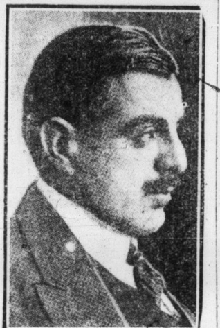
His Highness Aga Khan.

Widely travelled and as well known in the best English and French circles as in India, the Aga Khan has done more valuable work in connection with the present word crisis than any other Indian potentate by feely and wisely using his great position as the acknowledged leader of the Indian Moslems and the spiritual head of a widely-distributed section of the followers of the Prophet, the Ismailis. When the war cloud burst he was in Zanzibar on the outset of a tour to meet his followers in Africa, and he immediately telegraphed to the councils of the Ismailis