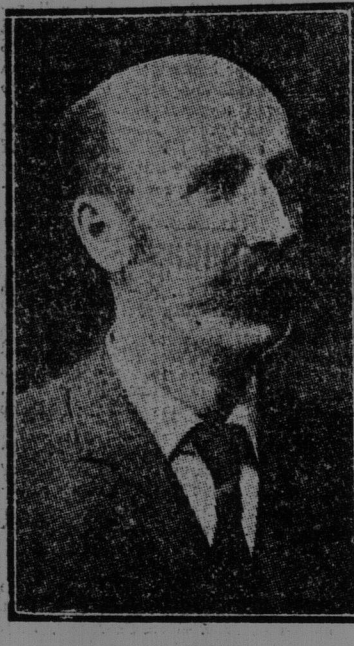
Liberal Candidate in Charlotte Liberal Candidate in Queens-