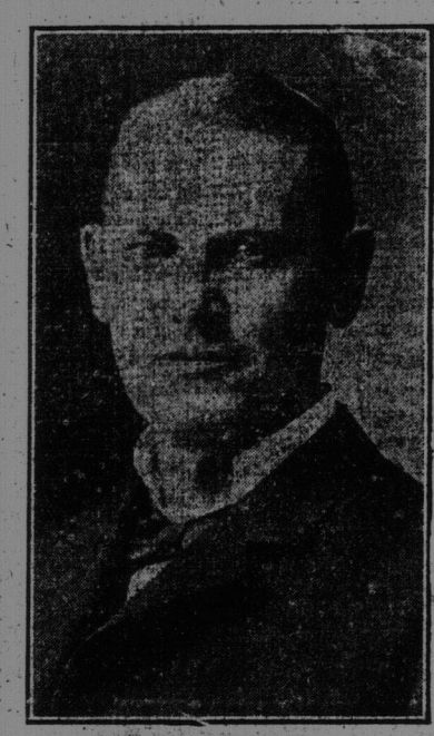
Liberal Candidate in Carleton