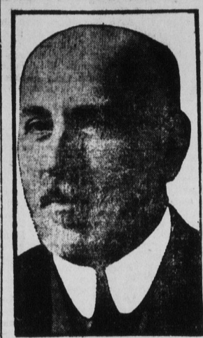
SIR JOHN WILLISON.