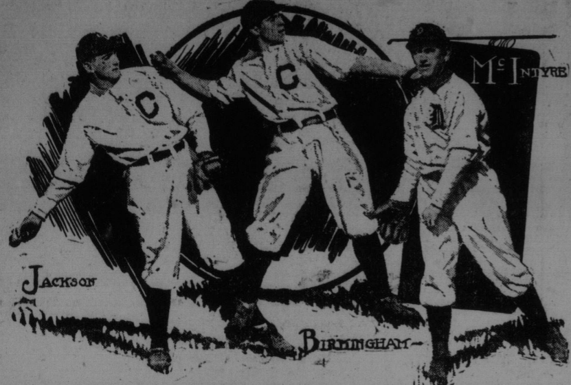
BASEBALL'S THREE GREATEST THROWING OUTFIELDERS.