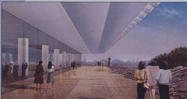
Artist's Impression of the Canada Garden

At Memorial Park, the Canada space — a quality of the in Japan and therefore greatly the exhibition and reception layout takes the visitor on a journey across eastern Canada, the Atlantic Ocean, down the Mackenzie River and the Rockies to Vancouver Island "stepping stones," and in a Japanese-style garden. It stands a modern representation from Inuit hunters to decoy animals. The Affin Island Corporation. The bronze sculpture by Maryon