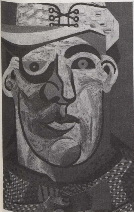
Le Bucheron, in oil by Alfred Pellán, 1947.

The exhibition was composed of about one quarter of the more than 1 000 works of art including paintings, sculpture, drawings, watercolours and graphics collected by Mr. Longstaffe between 1959 and 1984.