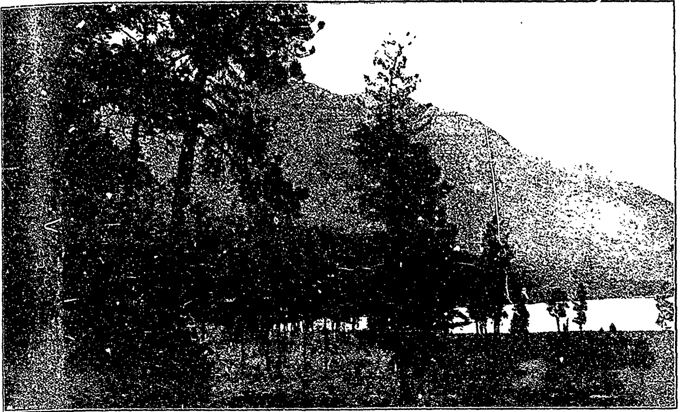
NEAR THE LAKE SHORE, CASCADE CITY, B.C.