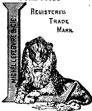
Lion "L" Brand.

Leading Dealers from Ocean to Ocean Handle these Goods.