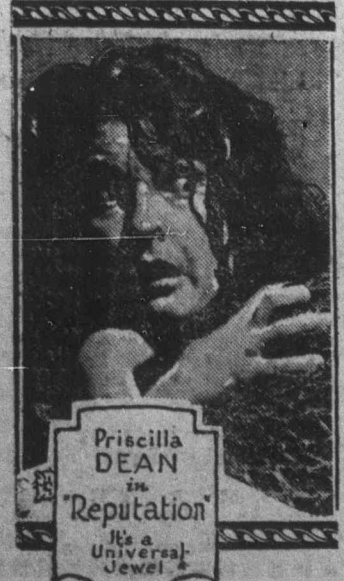
Priscilla DEAN in "Reputation" It's a Universal Jewel