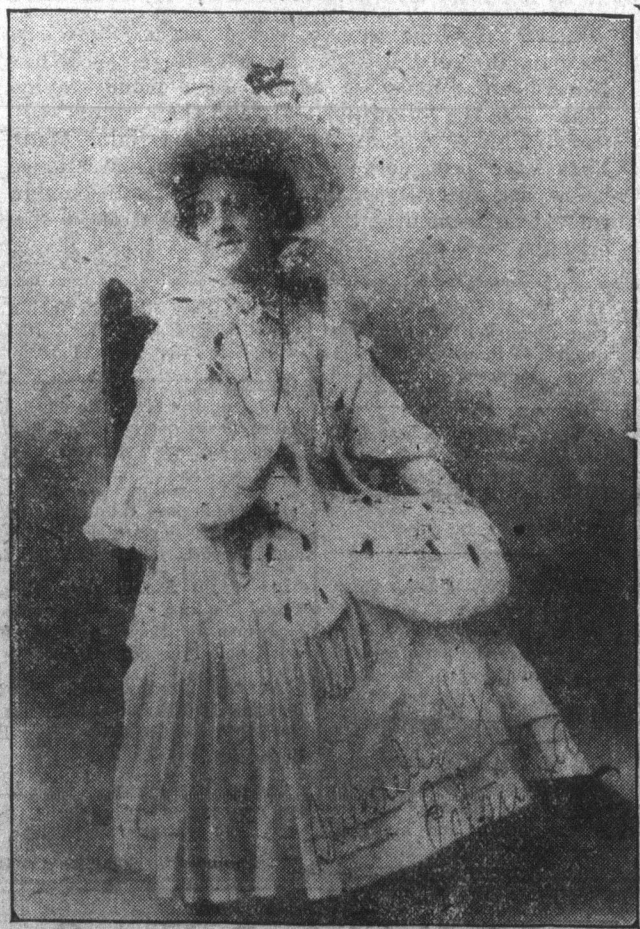
Elsie Janis who Appears at the Grand To-Morrow in "THE LITTLE DUCHESS"