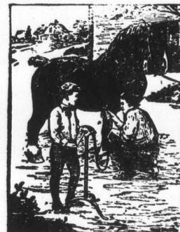
Stewart No. 1, Ball Bearing, Horse Clipping Machine in Operation.