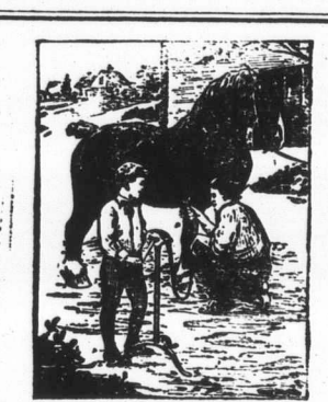
Stewart No. 1, Ball Bearing, Horse Clipping Machine in Operation.