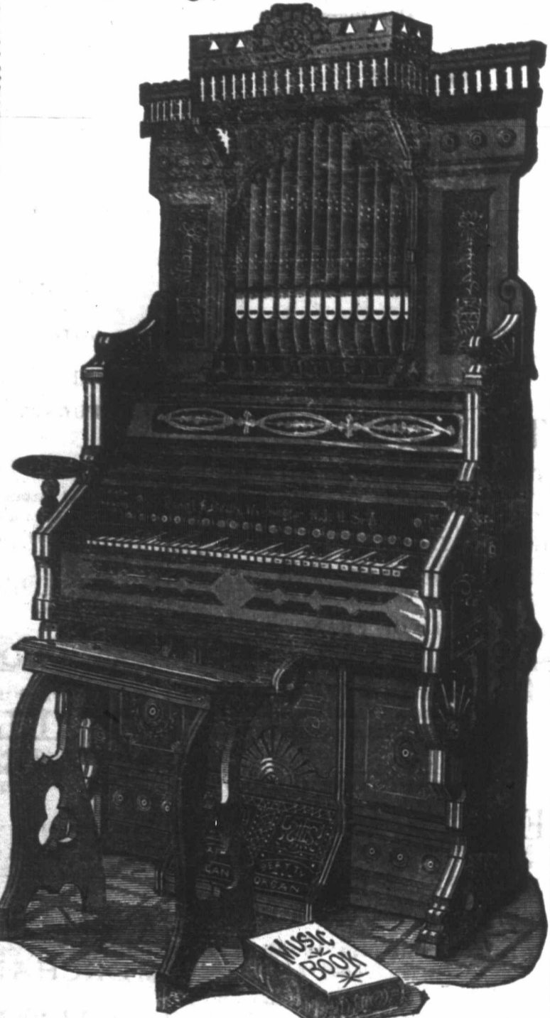
NEW STYLE No. 9500. SOLID WALNUT CASE. Dimensions: Height, 5 feet, Length 14 ins., Depth, 21 ins.

If you want an Organ built on the old plan with 8 to 11 Stops, I can furnish them now for $30, $40, $50