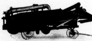
Rumely Ideal Separator

The Rumely GasPull is a gasoline tractor—an all around machine to meet the various power needs of the average farm—tractive or belt.