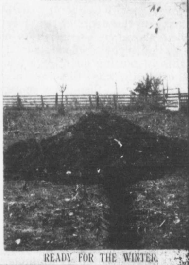
READY FOR THE WINTER.

was nodysentery. The combs where clean and dry and full of honey, but the bees had deserted the hives, and crawled all through the straw. Per-