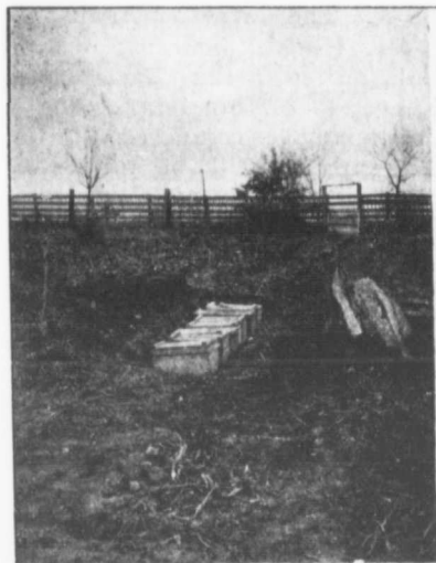
READY FOR THE RAILS.

haps the heat generated by so great a number piled in such close quarters drove out the bees, Perhaps they went in search of air. They certainly