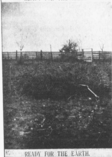
READY FOR THE EARTH.