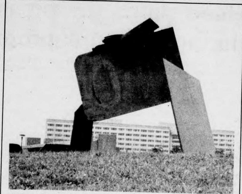
Anthony Caro's iron sculptures littered across a vacant field at the south-east corner of York, have often been the subjects of scorn. See story on page 12.