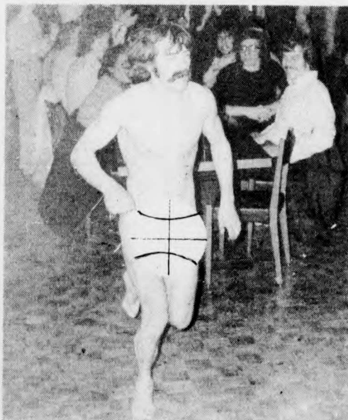
Rugby festival is invaded by the basketball team. Here, an ace player breaks in for a lay-up unimpeded by clothing, but misses.

This surplus of springtime energy seems to manifest itself in other ways. Perhaps exam and essay pressures are starting to show their effect on York students. The regular tide of campus neurotics should soon be reaching a peak. Security even reported a student arriving at the missing articles office last week. He wanted to find himself, we were told, and the charter flights to Europe were getting just too expensive.