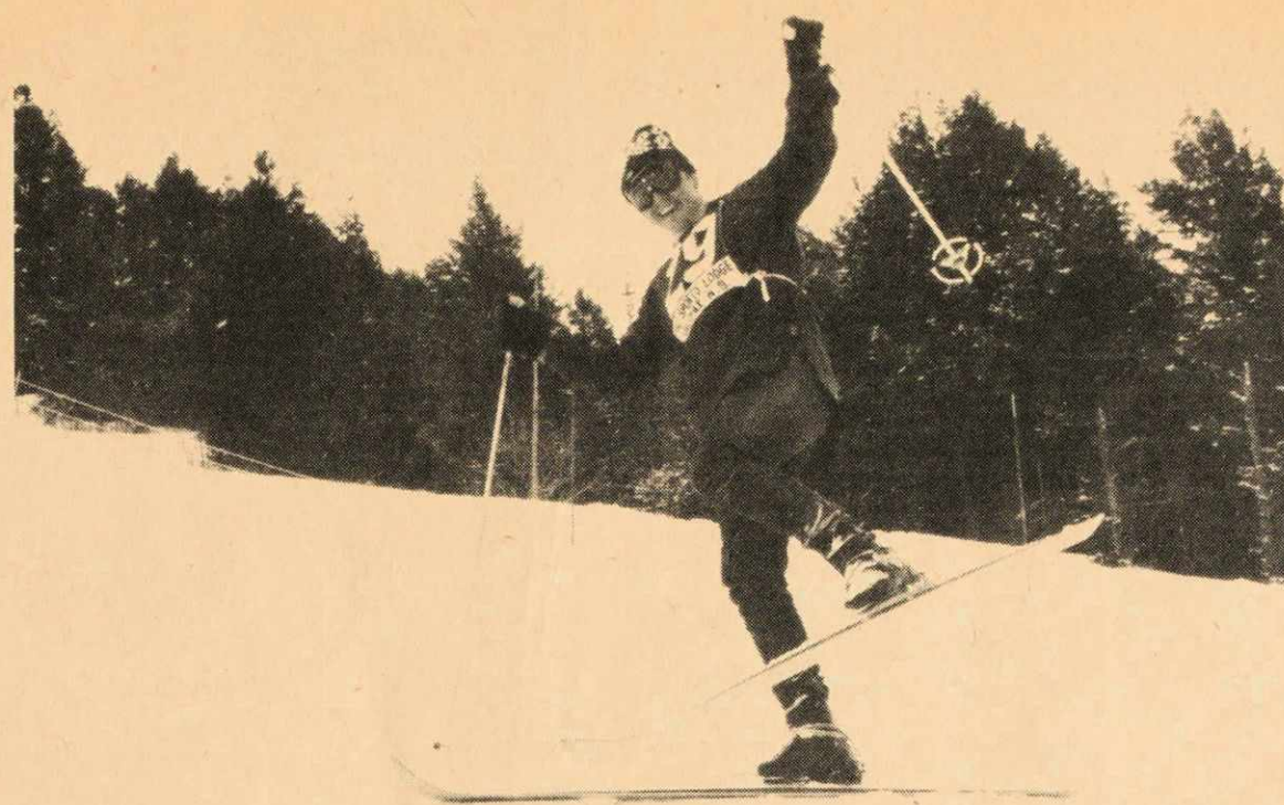
An unidentified Dalhousie skier waves his arms enthusiastically after Dal had won the MIAA Skiing Championship at Wentworth Valley last weekend for the first time ever.

The Tigers opened an early 11-3 lead, then hit a prolonged dry spell as they did not score for 7 or 8 minutes while the Axemen came back. As it was