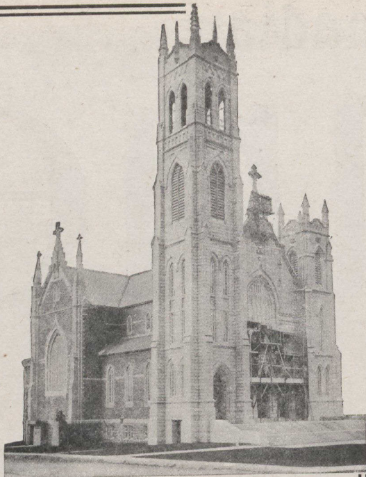
St. Viateur R.C. Church, Montreal, Roofed with ASBESTOSLATE

From the huge "Dominion Building" in the Toronto Exhibition Grounds, and the new "Machinery Hall" in the Ottawa Fair Grounds, to the little Public Shelter recently erected on Fletcher's Field, Montreal, all kinds of Public Buildings, all over Canada, are being roofed with ASBESTOSLATE.