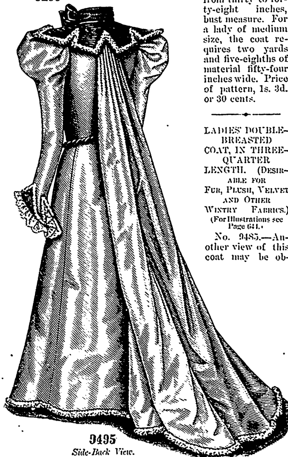
9495 Side-Back View.

tained by referring to figure No. 211 B in this publication. This comfortable coat is here represented made of seal-skin, for which, as well as for plush, velvet, etc., it is eminently suitable. It is in three-quarter length and is closely fitted at the sides and back by under-arm and side-back gores and a curv-