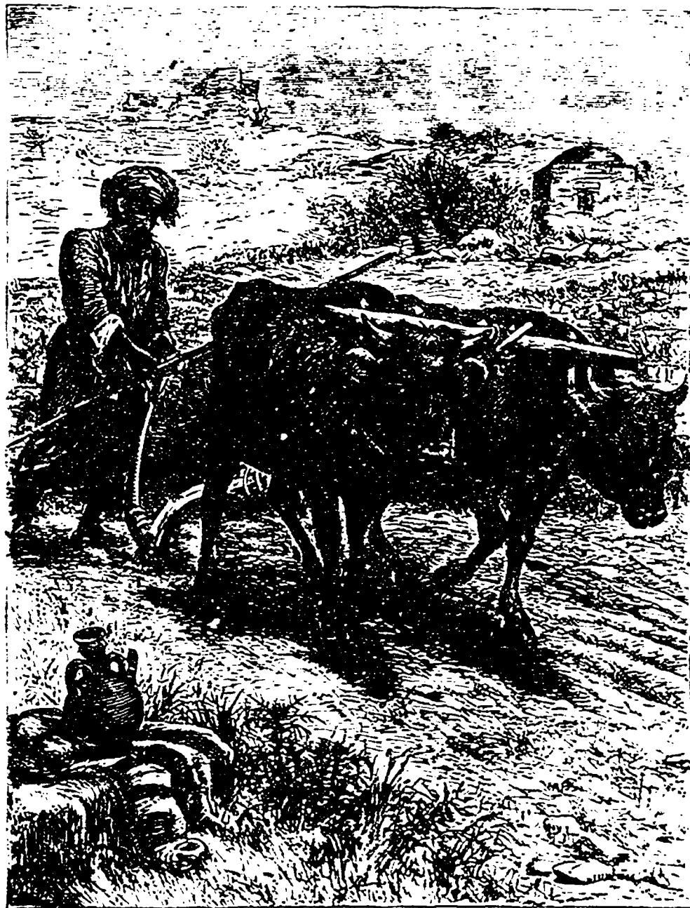
PLOUGHING IN EGYPT.