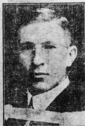
Brings Honor to Canada.

A despatch from Halifax, N.S., says:—Premier E. H. Armstrong has introduced a bill in the local House of Assembly amending the Rule of the Road and the Motor Vehicle Act, conforming to the traffic rule prevailing in all other provinces of the Dominion, which have adopted the "drive to the right" policy. There was no discussion.