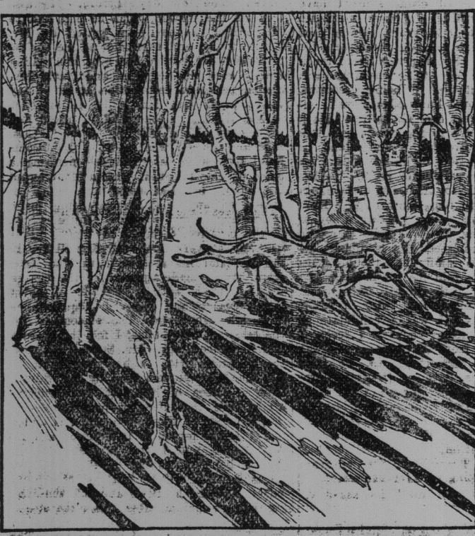
FIND THE RABBIT WHICH THE HOUNDS ARE PURSUING.