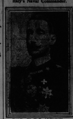
DUKE OF THE ABRUZZI.