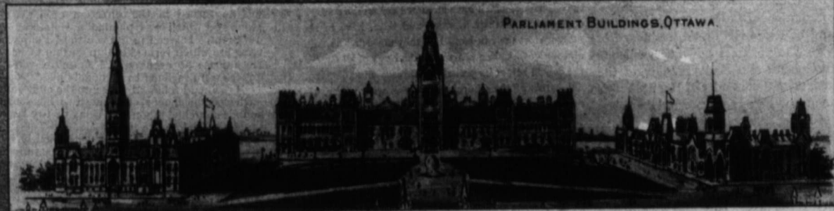
PARLIAMENT BUILDINGS, OTTAWA.