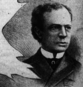
HON. WILFRED LAURIER.