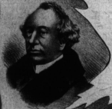
SIR JOHN A. MACDONALD.