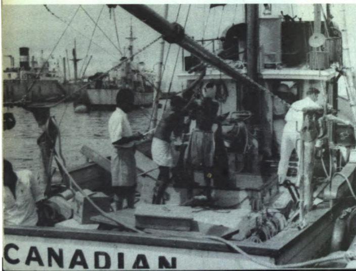
Men at work in one of the Canadian fisheries trawlers in Ceylon.

In many countries the foundations for such an acceleration have been laid in the past ten years. Organized, planned efforts to speed development are under way all over the Colombo Plan area, and a great deal has already been done to provide the skilled and trained manpower and the basic capital facilities upon which further development can now be built. The Colombo Plan has been the source of much of this progress. The Plan has helped to bring hope to millions of people in South and South-East Asia that their lot can be improved, to demonstrate that they can count on effective support from the people of more economically advanced countries and to prove that developed and less-developed nations can work together in free cooperation to achieve tangible advances in living standards.