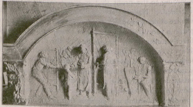
SKETCH MODEL FOR TERRA COTTA, BROWN BROS.' WAREHOUSE, TORONTO. By W. J. Hynes, Toronto. Beaumont Jarvis, Architect.

water, and add a few drops of muriatic or sulphuric acid to each. In the first glass nothing can be observed, while in the second glass we will see in the shape of small bubbles the carbonic acid escape, which has been absorbed by the lime from the atmospheric air circulating in the heap.