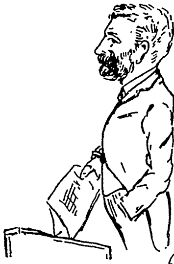
HON. W. S. FIELDING.

OUR sketches this week represent the Provincial Secretary, Mr. Fielding, making one of his characteristic speeches in the House of Assembly. Mr. Fielding, who speaks in a quick but very decisive manner, is at times, especially when there is any opposition, an exceedingly eloquent speaker. He brings out his arguments and facts in a clear, straight-from-the-shoulder manner that is very convincing to his audience, and he never says anything unthought of and that he would wish to recall in a more calm moment.