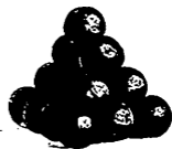
POLISHED STEEL BALLS FOR MASSEY-HARRIS PERFECTED BEARINGS.

Massey-Harris machines for the season of '99 will be fully equipped with Perfected Roller and Ball Bearings.