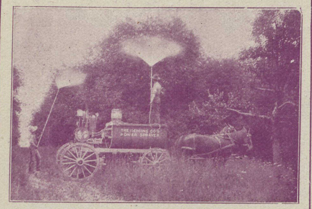
THE "DEMING" POWER SPRAYER IN OPERATION