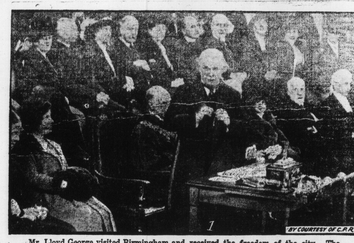
Mr. Lloyd George visited Birmingham and received the freedom of the city. The Premier delivered an important speech chiefly with regard to the revision of the peace treaties.