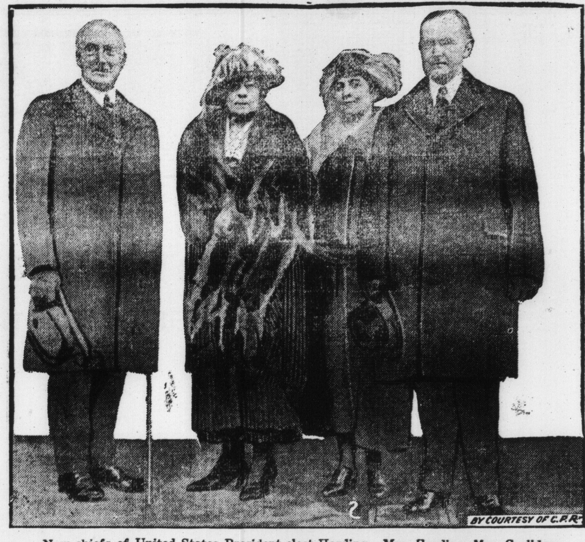
New chiefs of United States President-elect Harding, Mrs. Harding, Mrs. Coolidge and Mr. Coolidge, Vice-President.

MUSIC INSTRUCTOR Voice, Violin, Orchestra Music for Dancing. PHONE 48. - Carlton Corner