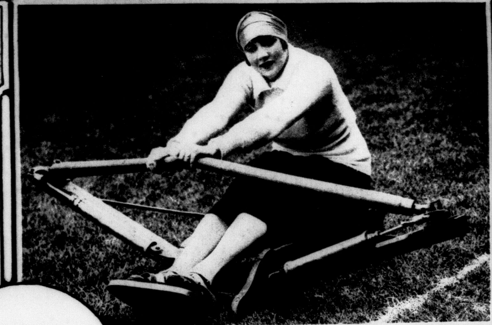
Betty Blythe, the screen actress, exercising on a rowing machine