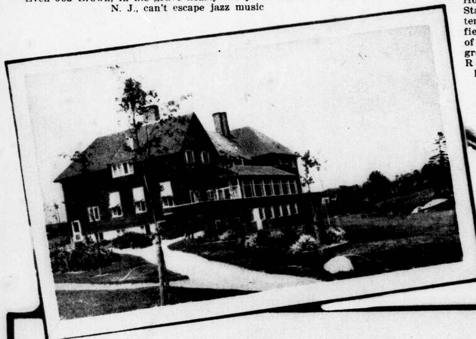
The club house and grounds of the Summit Golf Club, near Richmond Hill, one of the prettiest of the many golf courses in the Toronto metropolitan area