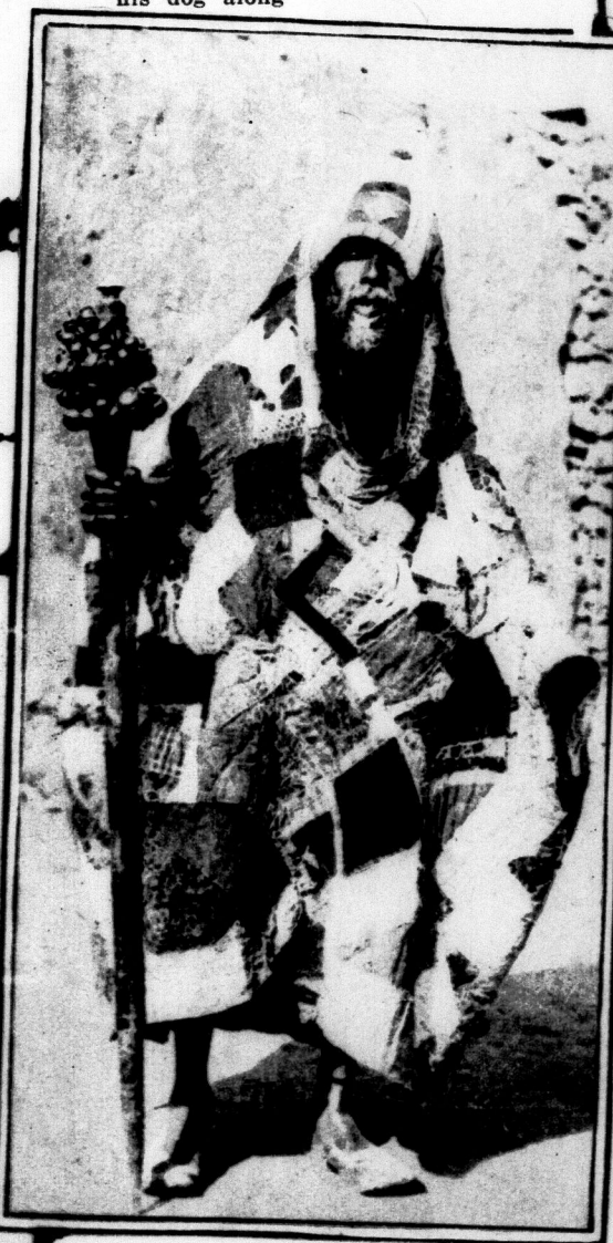
One of Turkey's 20,000 dancing and howling Dervishes, who may disappear because of an order closing the Moslem monasteries in that country