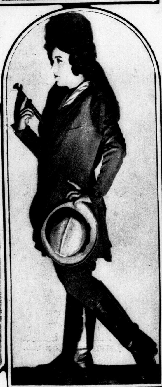
Lola Todd, screen star, wearing a smart new riding costume