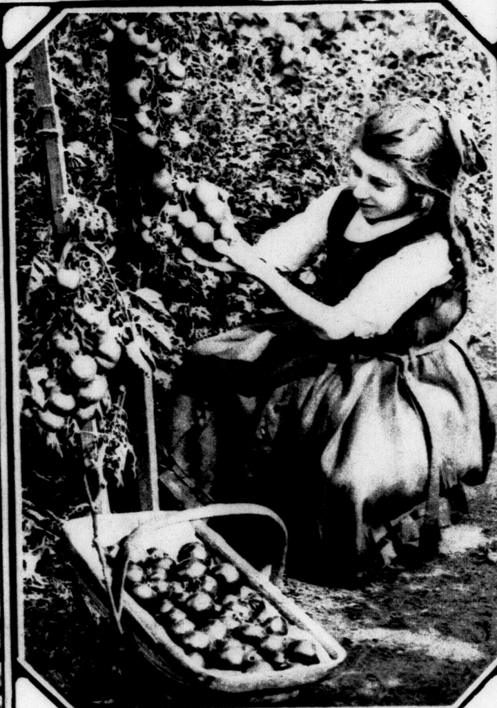
One of many girls in old London who have grown fine garden crops under the L. C. C. botany plan