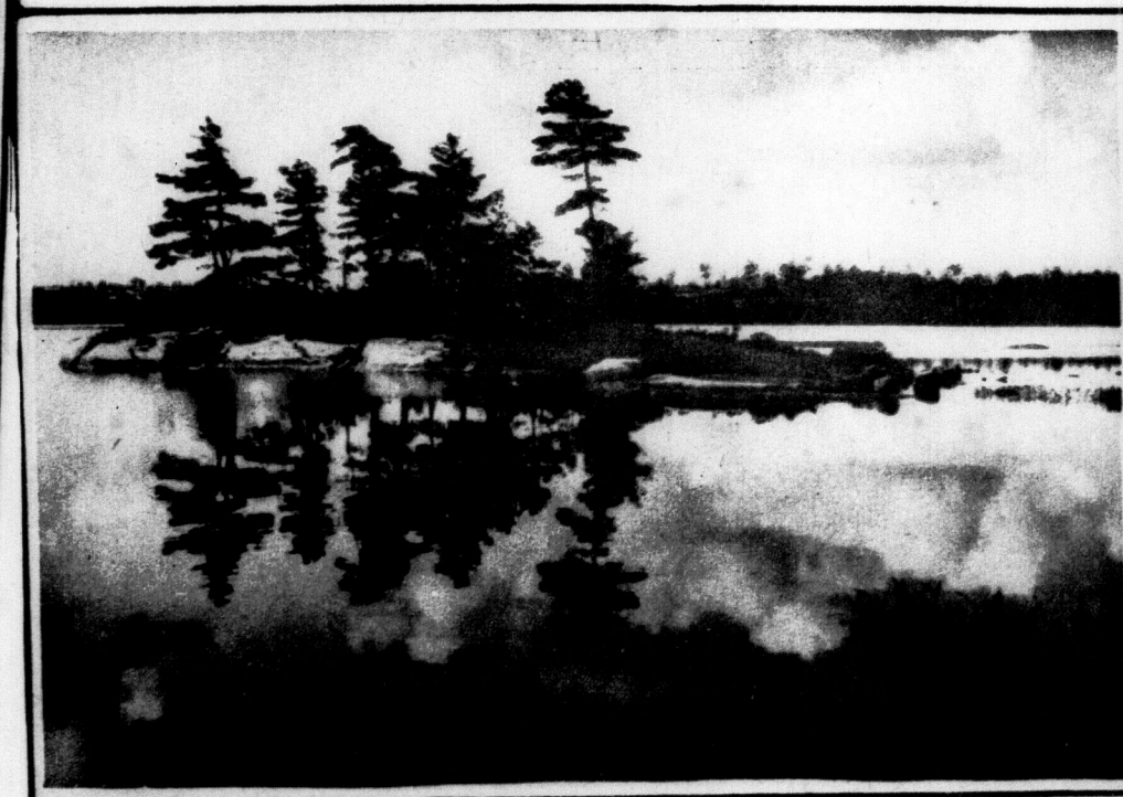
A beauty spot in Muskoka