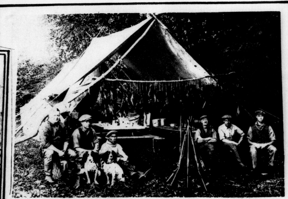
A morning shoot of a duck hunting party near Ottawa