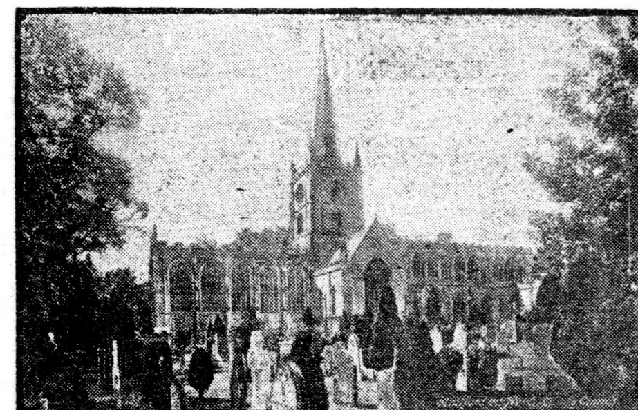
TRINITY CHURCH, STRATFORD-ON-AVON Where Shakespeare Is Buried.

August 5, Thursday. Arrive at Quebec. August 6, Friday. Home again.