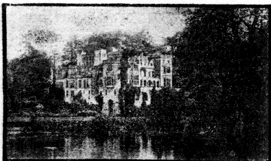
GUY'S CLIFF, WARWICK, ENGLAND

MONTREAL QUEBEC LIVERPOOL GLASGOW LOCH LOMOND LOCH KATRINE EDINBURGH WARWICK