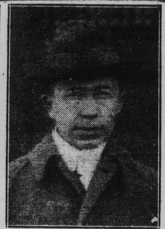
Awarded Prize. The National Geographic Society has awarded the Grant Squires Prize to Vilhjalmur Stefansson in recognition of his book "The Friendly Arctic," as the outstanding geographic production of 1921.

The oldest love-letter in the world is in the British Museum. It is a proposal of marriage for the hand of an Egyptian princess, and was made over 3,500 years ago. It is in the form of an inscribed brick, and is, therefore, not only the oldest, but the most substantial, love-letter in existence.