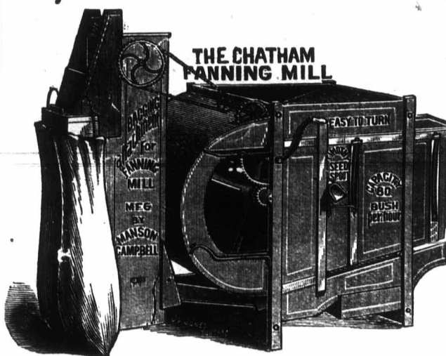
THE CHATHAM PANNING MILL

2,000 MILLS SOLD IN 1886 2,300 MILLS SOLD IN 1887 2,500 MILLS SOLD IN 1888 3,600 MILLS SOLD IN 1889 4,000 MILLS SOLD IN 1890