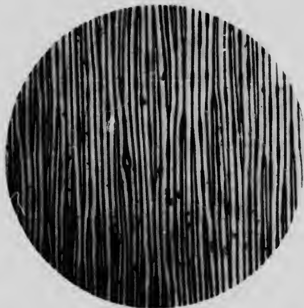
PLATE 51. PICEA NIGRA . Tangential section through the spring wood showing the structure of the two forms of medullary rays. \times 46.8