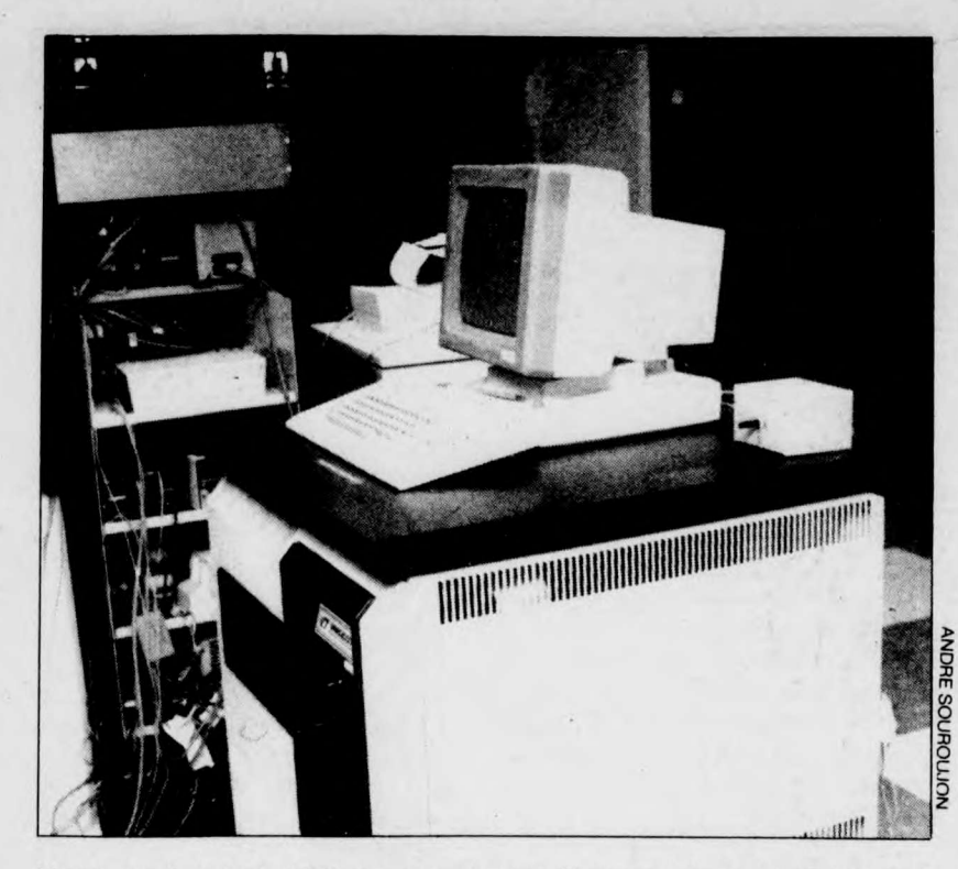
York's computerized Voice Enrolment System (above) will accommodate over 15,000 students during course registration.