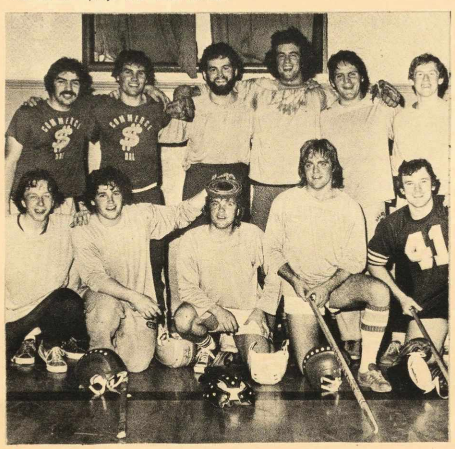
Happy hockey heroes

Congratulations are also in order to all other participating faculties who survived another year playing the roughest game in Intramural