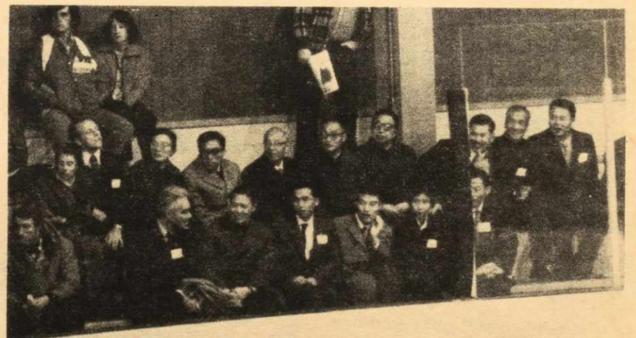
People's Republic of China representatives viewed the match-up.

All copy submitted to the Gazette must be typed.