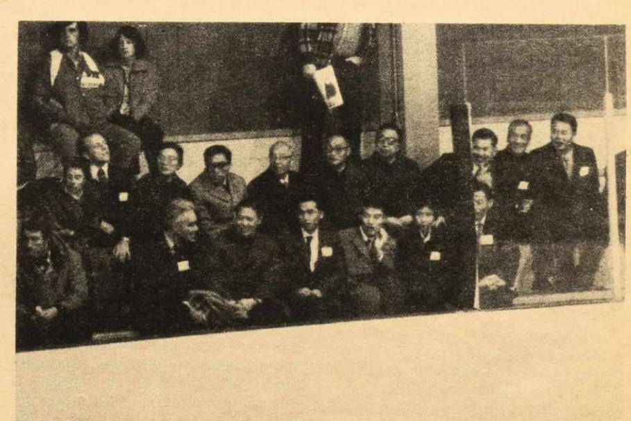
People's Republic of China representatives viewed the match-up.

All copy submitted to the Gazette must be typed.