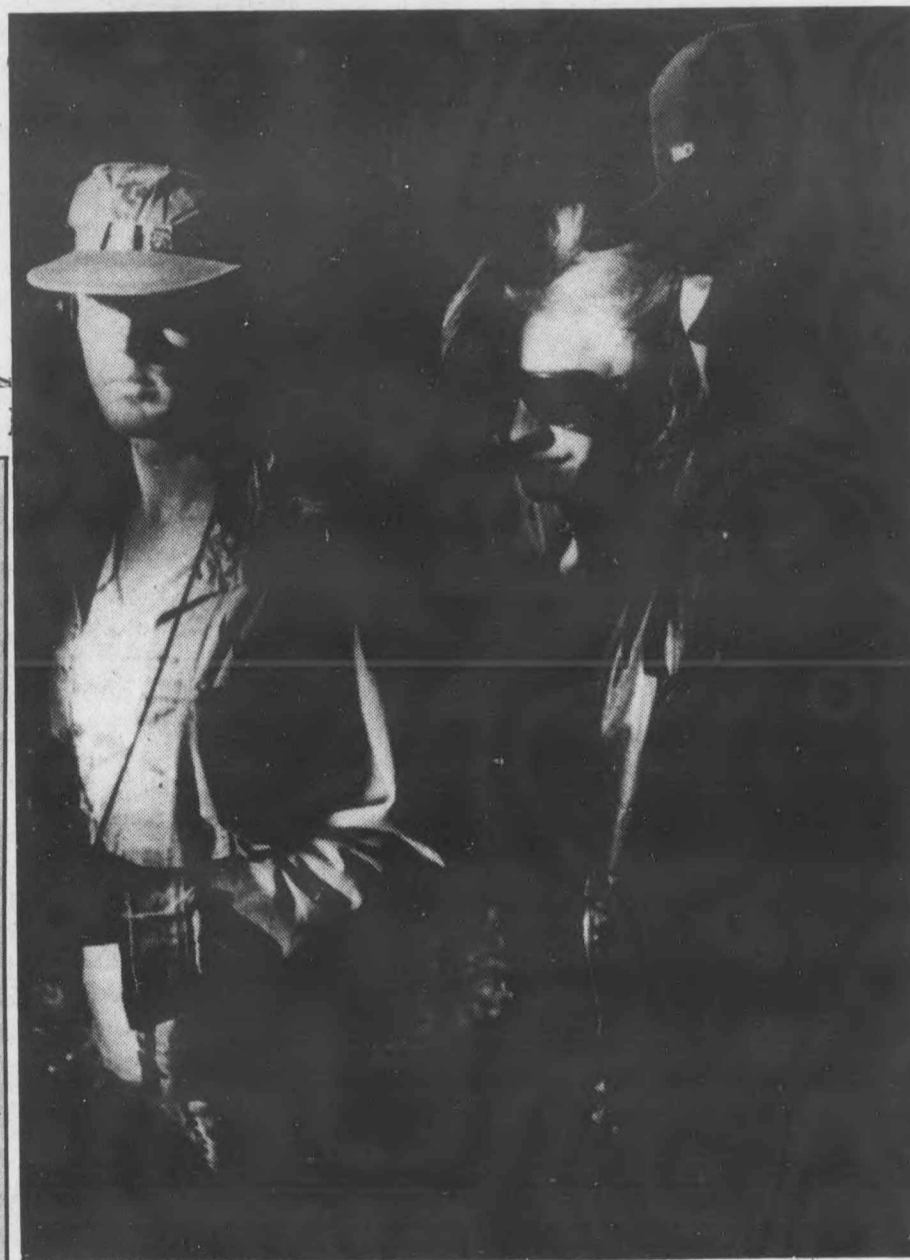
The lads from Skinny Puppy not looking very scary at all really.