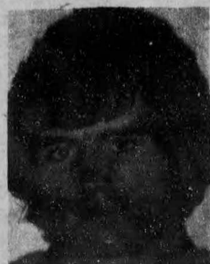
David Lynch stu I