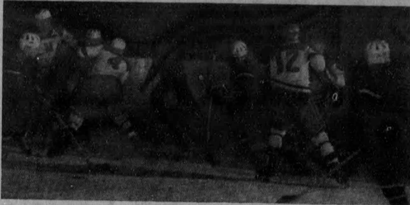
Players scramble for exit at conclusion of Saturday's lifeless tilt in which Devils outscored CMR 8-3.