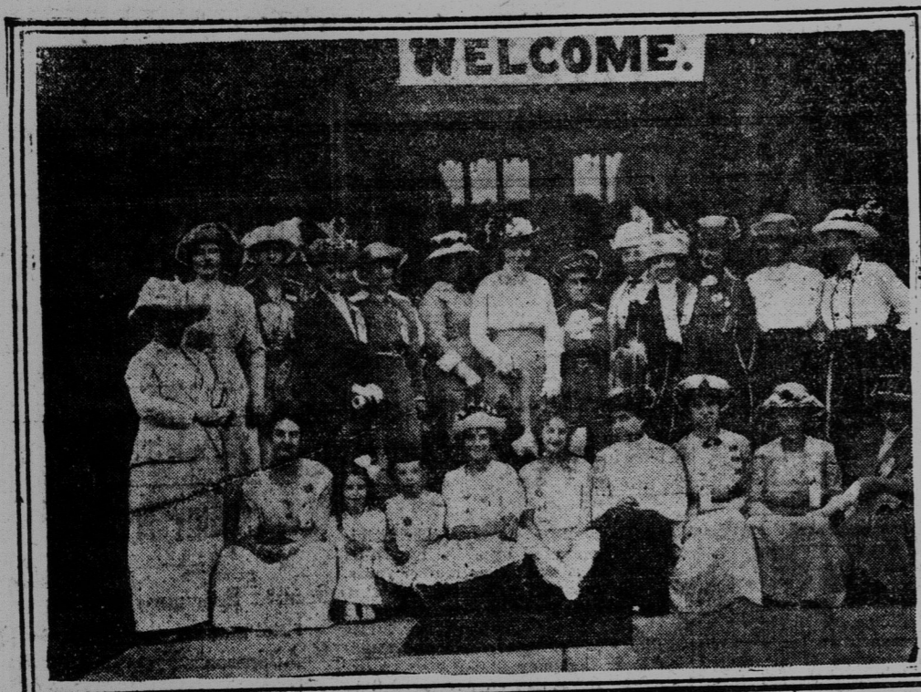
WIVES AND DAUGHTERS OF DELEGATES.