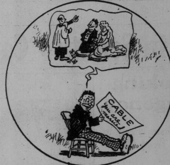
MARRIED BY PROXY