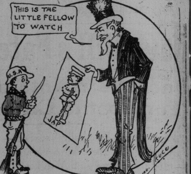
BE READY MY BOY